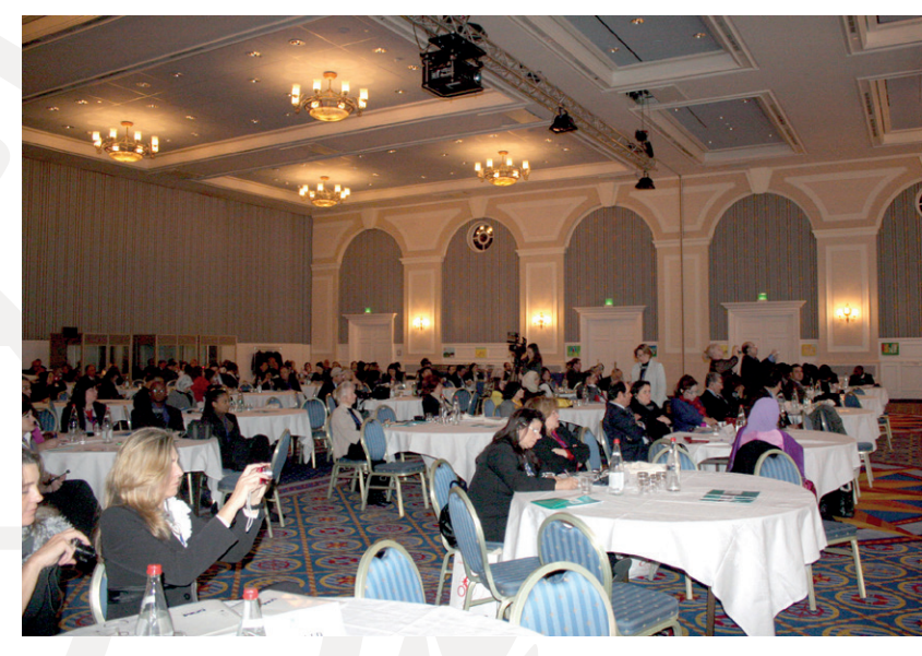
Audience during the WFS+5 Opening Ceremony