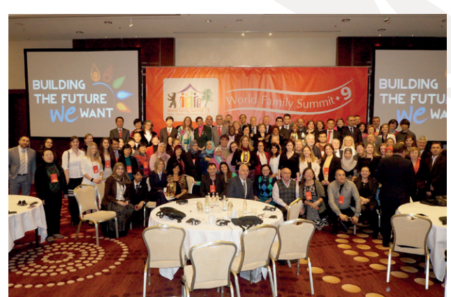
Group Photo Awarding Ceremony