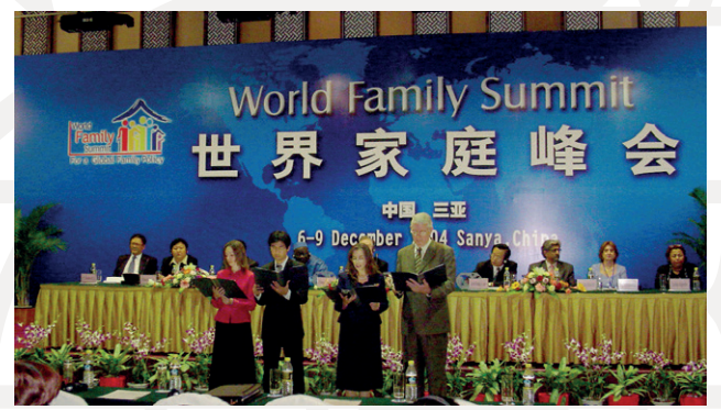
Family reading the final text of the Sanya Declaration