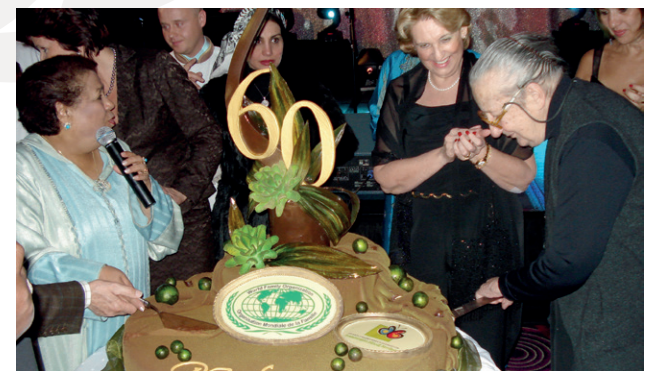
Celebration of WFO's 60th Anniversary during the WFS+3